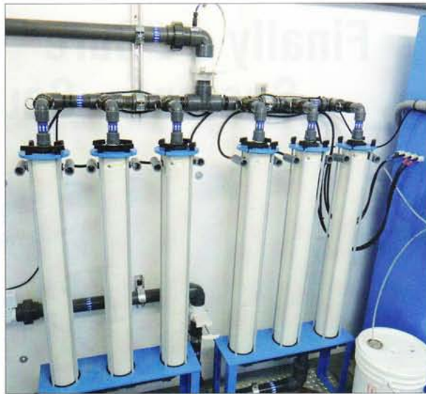
The ElectroPulse system from OilTrap Environmental (Tumwater, Washington) is wired to a central control panel (left). It adjusts the pH of the wastewater before sending it through a series of 4"-diameter (102mm) tubes fitted with electrically charged plates (right) that change the polarity of any suspended solids, causing them to cluster and float, and rendering any metals inert through oxidization.

difficulty hitting the conductivity benchmark, because seawater intrudes into the system through an underground