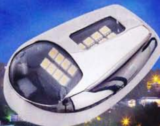
LED Side Mount Docking Lights