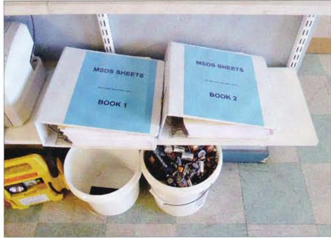
Proper disposal of all materials and recycling where possible are standard practices at KKMI. Left —Paint cans and lids are allowed to dry before being compacted and sent for recycling. Right —Plastic buckets in the yard store collect the spent batteries that workers come in to replace. Just inside the doors, also note the binders of MSDS (material safety data sheets) for all potentially harmful substances stocked in the store.