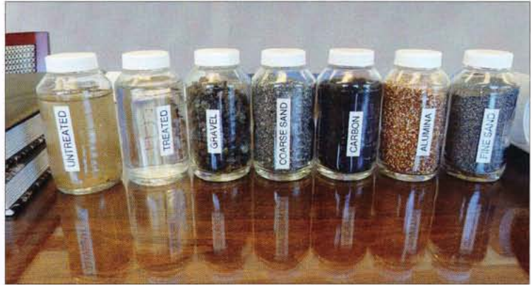
Left —Storm water from the entire 68,000-sq-ft (6,317m 2 ) Sausalito yard ends up in this 1,000-gallon (3,785-l) settling tank, affectionately referred to as “the wishing well.” From there, three pumps of varying capacities pump it up to a rooftop AQUIP system from StormwaterRX (Portland, Oregon), capable of filtering 110 gal (416.4 l) per minute. Right —Samples of treated and untreated water and the five filter media in the AQUIP filter tank. Treated stormwater can be discharged directly into the bay.

tank, and the filter-bed material must be replaced annually. Storm water from the AQUIP system is clean enough to be discharged into the bay.