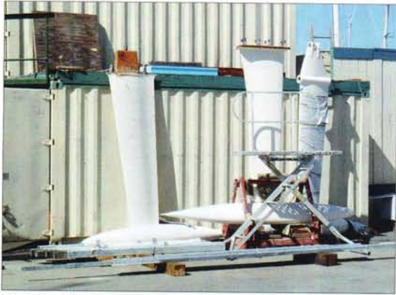
Bulb keels—some canting, some fixed—are indicative of clients who often push the structural tolerances of their high-performance sailboats and rely on the yard to maintain and tune the racing machines.

working at safety margins that are less and less.”