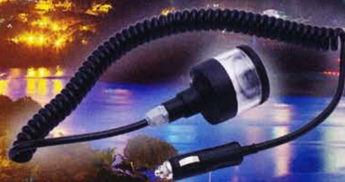
LED Portable Underwater Light