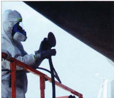
Above —Years of experience has led KKMI to conclude that for sanding, vacuum sanders and tarping are a better solution to trap particles and meet air emission standards than wet-sanding, which requires disposal of an even larger mess of contaminated water. Right —An open-topped shipping container covered in clear plastic serves as a reasonably priced spray booth with good ambient light and no risk of explosion from electric lights.