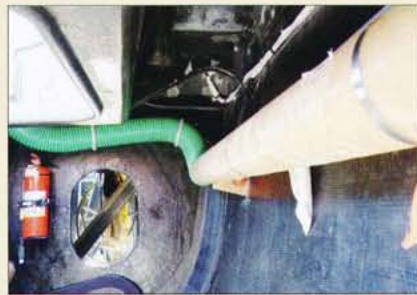
Changes to USA 76 included, from left to right: an electrical system complete with panel; a Yanmar auxiliary engine with attendant fuel tank, fire-suppression systems, and ventilation; and five watertight bulkheads, one shown here with a watertight penetration open.

was different. The new bulkheads were plywood sheathed with epoxy and fiberglass material. Kaplan said his crew installed carbon fiber hat sections as stringers to support the Yanmar diesel auxiliary, but other than that, the composites were more workboat than raceboat.