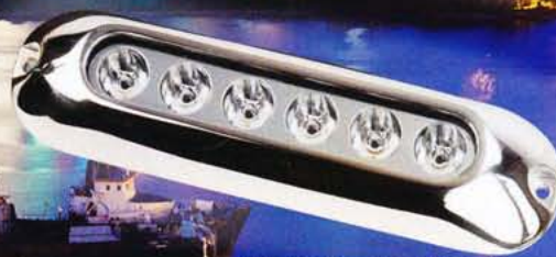
LED Underwater Light