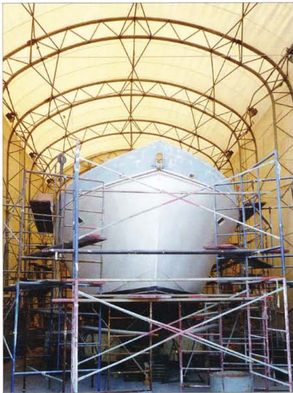
Due to limitations on new buildings built within 100' (30.4m) of the high-water mark, many of KKMI's shelters for larger boats are temporary fabric-covered structures such as this one for a 1970s motor-yacht in for core repairs and a paint job.

The dredged water depth quickly pigeonholed the yard as a big-boat facility. When it hosted five maxis during the September 1996 big-boat race series on San Francisco Bay, the reputation became even more ingrained. More big-boat action came as Oracle Racing ramped up its Golden Gate Yacht Club-based challenge for the 2002 America's Cup , and in 2003 the yard hosted USA 76 (see the sidebar on page 22) and Alinghi (winner of the 2002 cup) when they sailed a series on the bay. Kaplan said it's nice to be known as a yard respected by some of the world's most serious sailors, but the size association isn't always useful. They have