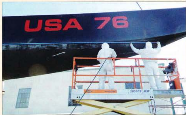
Crews tape the waterline of USA 76 in KKMI's Point Richmond yard. In 2011 the yard converted the 2001 America's Cup boat for day-charter service.